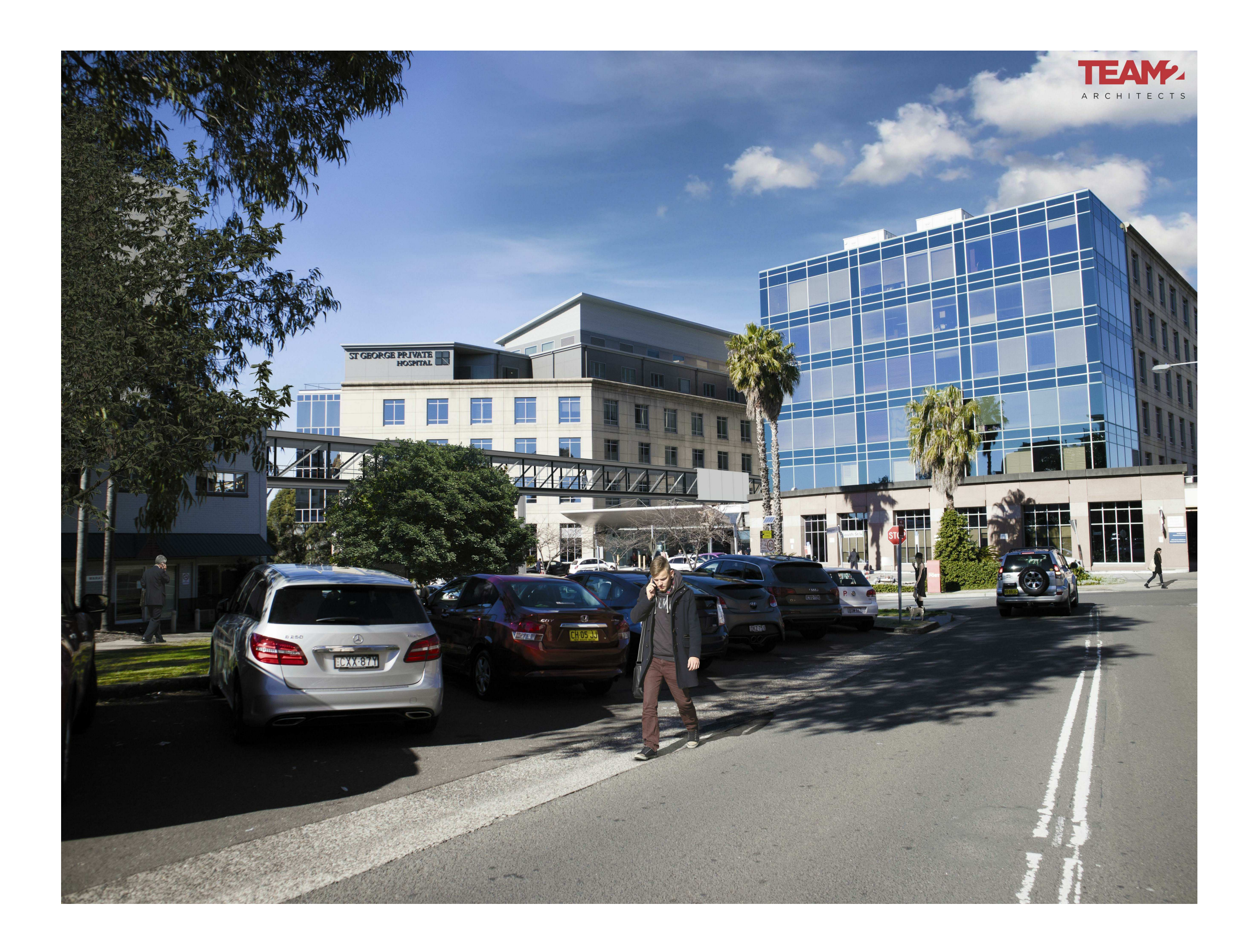
VIEW FROM MONTGOMERY STREET